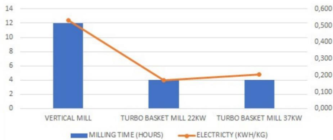
ELECTRICITY CONSUMPTION & PROCESS TIME OF RED OXIDE

MIXERS . TANKS . PIPING . M&E . AUTOMATION